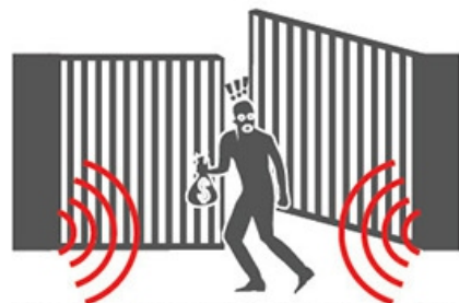
Function 2 : As An Intruder Alarm System

The infrared safety beam is also acting as an intruder detector