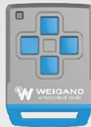
Multi-functions Handy Remote Control